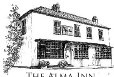
THE ALMA INN